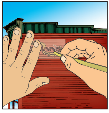
1. Position and rub Decal with Burnisher (DT600) or a dull pencil.