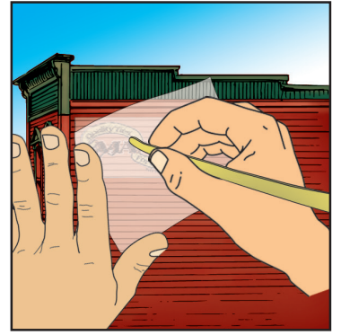
3. Place backing over Decal and burnish again.