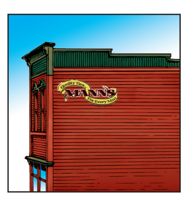
4. Finished Decal conforms to texture.