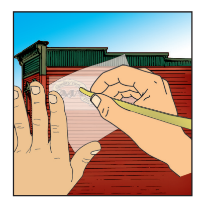
3. Place backing over Decal and burnish again.