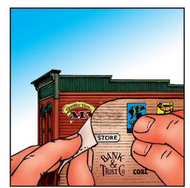
2. Lift away carrier sheet carefully.