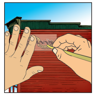
1. Position and rub Decal with Burnisher (DT600) or a dull pencil.