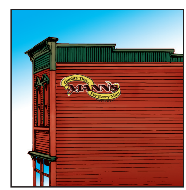
4. Finished Decal conforms to texture.

Conforms to Health Requirements of ASTM D4236