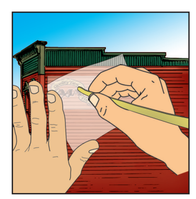
3. Place backing over Decal and burnish again.