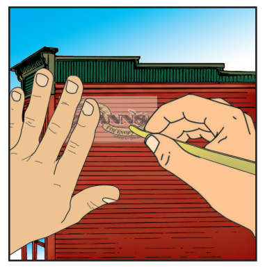
1. Position and rub Decal with Burnisher (DT600) or a dull pencil.